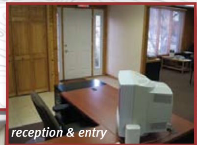
reception & entry

See next page for floor plan and amenities.